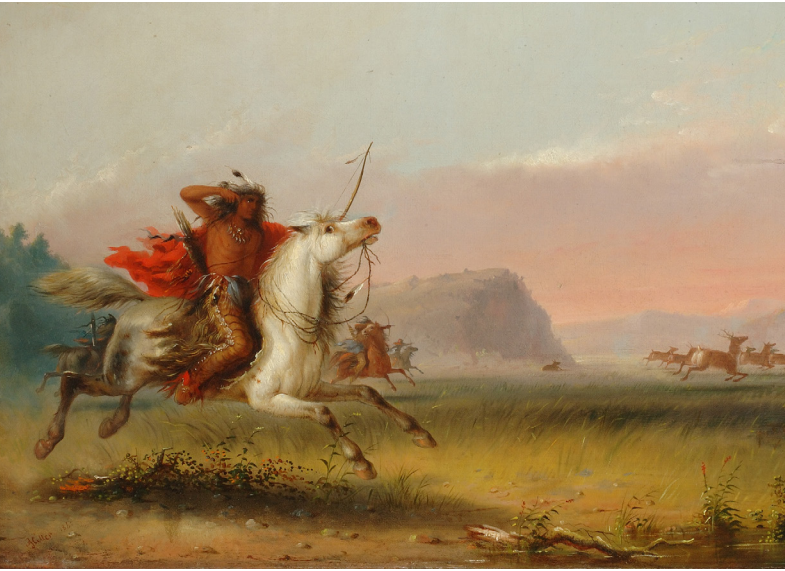
HUNTING ELK, ALFRED JACOB MILLER, OIL, C. 1837. UNIVERSITY OF WYOMING, AMERICAN HERITAGE CENTER, ACCESSION NUMBER 4912.