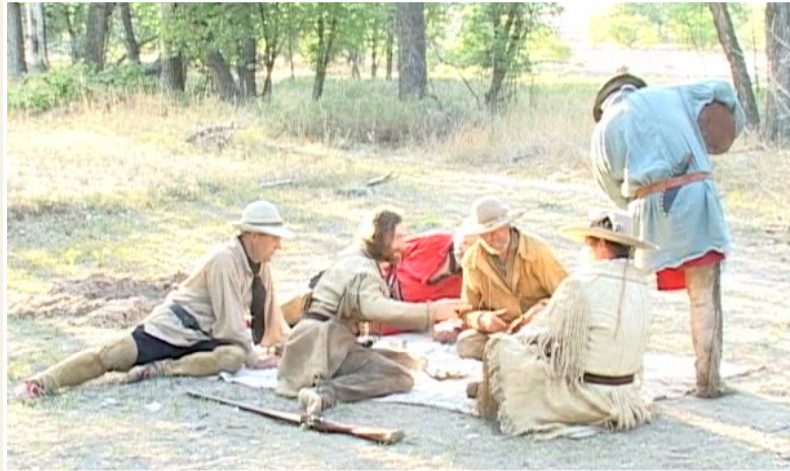
Above: Historical interpreters enact a tableau vivant of Miller's Dinner Party sketch, Fort Laramie National Historic Site, 2012.

Imagine the western paintings of Alfred Jacob Miller performed onstage with rich narration and action.